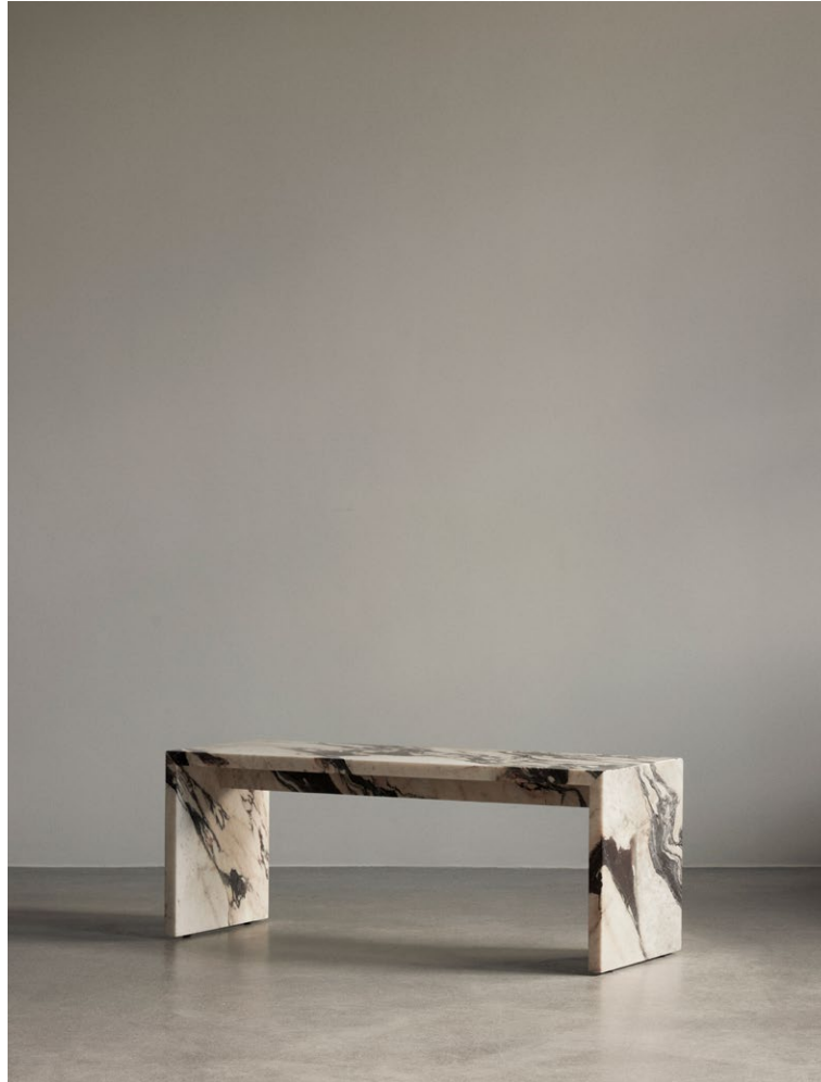
PLINTH BRIDGE Designed by Norm Architects